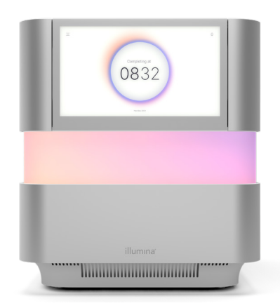
Figure 1: The NextSeq 2000 Sequencing System—The latest NGS system from Illumina offers innovative design features, advanced chemistry, simplified bioinformatics, and an intuitive workflow that enable the widest range of applications on a benchtop sequencing system.