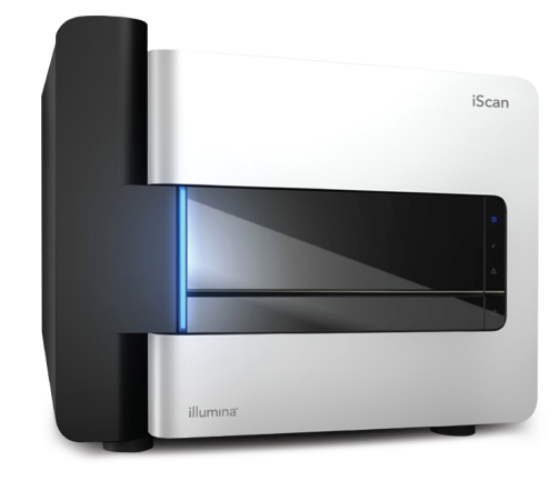
Figure 1: The iScan System —A fully automated system compatible with autoloading robotics and laboratory information management systems (LIMS) that offers a robust, high-throughput scanning solution.

With a high signal-to-noise ratio, high sensitivity, a low limit of detection, and a broad dynamic range, the iScan System produces exceptional data quality for use in a wide range of biomarker screening or validation studies. The high call rates (>99% with the Infinium Assay) enable powerful population screening studies and high-resolution CNV analysis, accurately detecting even single copy number changes. The iScan System is ideally suited for fast, accurate screening in agrigenomics or for complex disease validation studies. With sensitive measurements and a wide dynamic range, the system also offers excellent performance for methylation profiling studies.